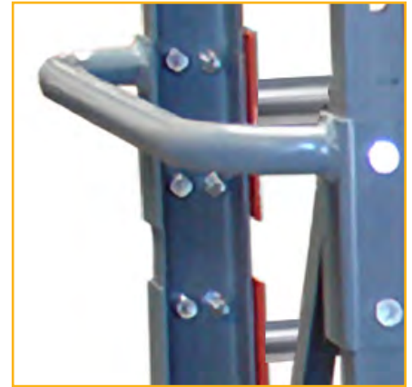
Push Handles for Steering